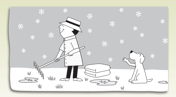
Right Time — don't apply fertilizer if the ground is frozen or right before an expected rainfall. Spring and Fall are the most important times to fertilize