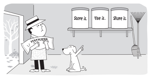
Store any leftover fertilizer sealed in its original container in a dry place for use next season. Share by giving it to a neighbour, a relative or donate it to a community group.