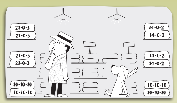
Right Source – read the bag before you buy to ensure you are using the right fertilizer for your lawn

The single most important thing you can do for your lawn is provide it with the proper nutrition. Fertilizer is like food for your lawn. The Urban Fertilizer Council recommends homeowners fertilize responsibly by following the 4Rs of fertilizer use: the Right Source of fertilizer at the Right Rate , the Right Time and the Right Place .