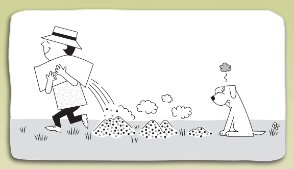
Right Rate – know the size of your lawn, only buy what you need and apply following recommendations on the bag. A good quality fertilizer spreader can help with proper application