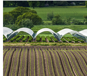
4R Nutrient Stewardship Training - Part 3