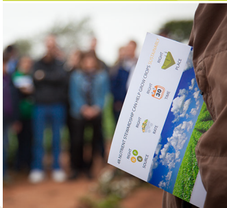
4R Nutrient Stewardship Training - Part 1