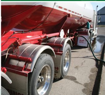
Anhydrous Ammonia Safe Storage and Handling