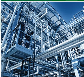
Ammonium Nitrate Security

Fertilizer Canada promotes the safe and secure manufacturing, handling, storage, transportation, and application of commercial fertilizers. The Canadian fertilizer industry is widely viewed as a world leader in fertilizer safety, with industry-leading, world-class Codes of Practice.