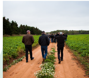
4R Nutrient Stewardship – Prince Edward Island