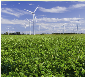
4R Nutrient Stewardship and Greenhouse Gas Reduction