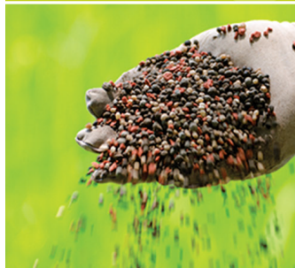
4R Nutrient Stewardship Training - Part 2