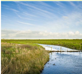
4R Essentials - A Short Course in 4R Nutrient Stewardship