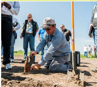
NERP Training Program